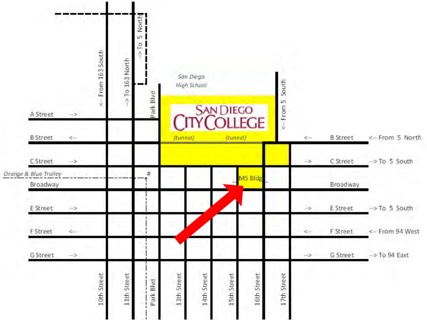
Close up of small yellow square labeled “MS Bldg”.